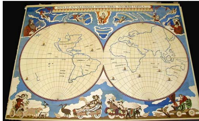
60" X 84" 17th Century Map of the World