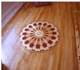
44" Classic Chal- lis Medallion

Let us make a work of ART for your FLOOR.