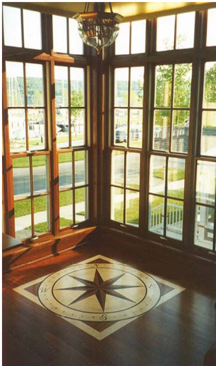
Arbor Compass Medallion

DLA's mission is to make a complicated custom job easy for our customers.