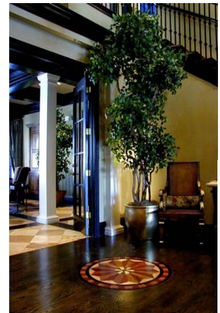
42" Hallmark Medallion